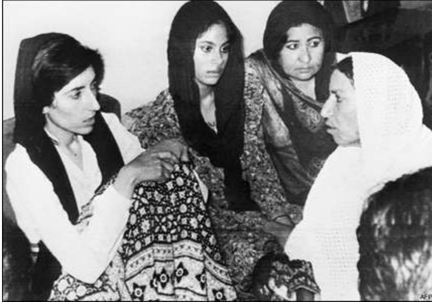
Benazir Bhutto receiving condolences from people after her release from confinement few weeks after Z. A. Bhutto was hanged.